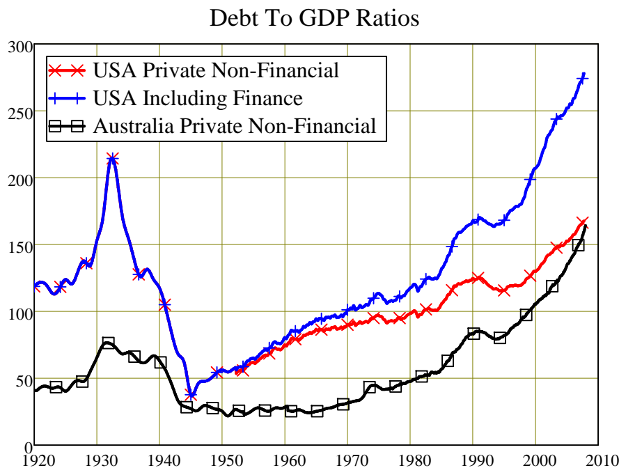
Figure 1: Debt to GDP Ratios over the Long Term

Those remedies worked in the past, not because they "solved the problem", but because they encouraged the renewal of the debt accumulation process. Each Federal Reserve rescue was followed by a renewed growth of debt relative to income--without which, the economy would have gone into a slump, rather than a boom.